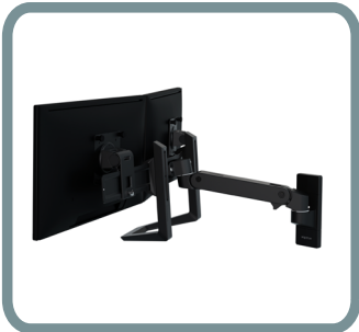
DUAL DIRECT KIT