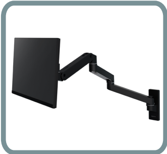
MONITOR ARM EXTENSION