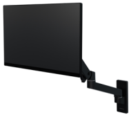
LX Pro Wall Monitor Arm