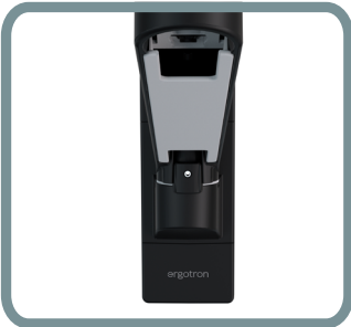
NEW ROTATION STOP PREVENT DAMAGE TO WALLS, PARTITIONS, OR CUBICLES