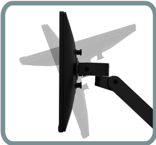
INCREASED TILT RANGE BETTER ERGONOMICS FOR USERS