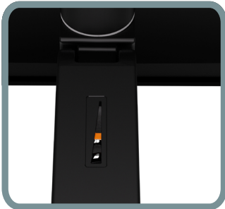
NEW TENSION INDICATOR SET TENSION LEVEL ONCE AND REPEAT FOR QUICK INSTALLATION OF MULTIPLE WORKSTATIONS